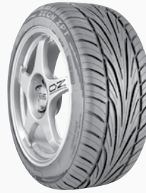
Cooper Zeon ZPT