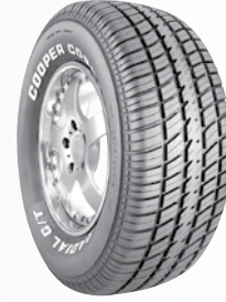
Cobra Radial G/T