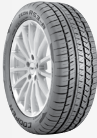
Cooper Zeon RS3-A