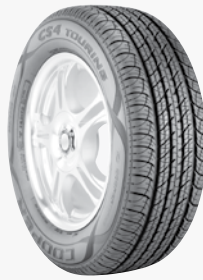
CS4 Touring (V/H-Rated)