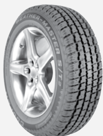
Weather-Master S/T 2