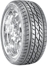
Cooper Zeon XST A