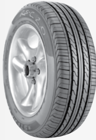
Starfire RS-C 2.0