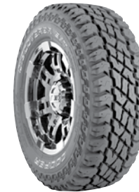
Discoverer S/T MAXX