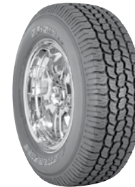
Starfire SF-510 LT