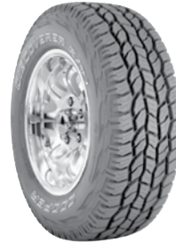
Discoverer A/T 3