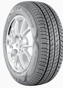
CS4 Touring (T-Rated)