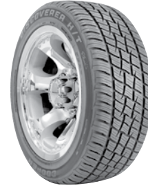
Discoverer H/T Plus