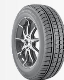
Discoverer M+S Sport