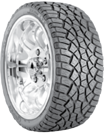
Cooper Zeon LTZ